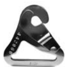
CLIP TYPE END FITTING P/N 442868 (Steel) $24.90 Ea.