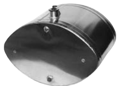
PITTS SPECIAL FUEL TANK