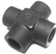
AN918 CROSS INTERNAL PIPE THREAD