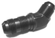
AN837 ELBOW, FLARED TUBE, BULKHEAD AND UNIVERSAL 45°