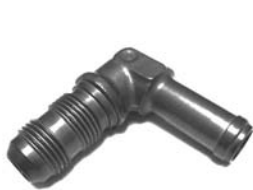
AN838 ELBOW, BULKHEAD & HOSE TO UNIVERSAL, 90°